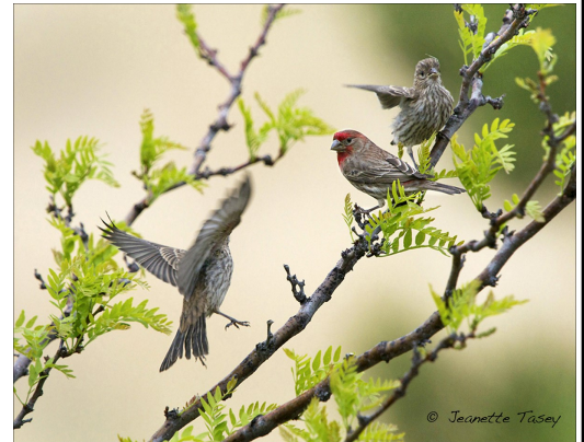
HOUSE FINCHES

MONTANA FISH, WILDLIFE & PARKS (FWP) is planning some exciting field work for this summer. FWP will have multiple opportunities to help us learn more about several species.