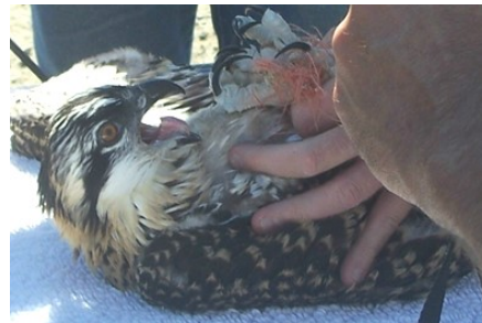
Nestling being de-twined at banding. Unfortunately, he had to be freed again around fledging time.