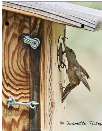
HOUSE WREN.