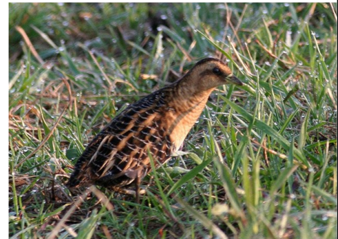
Yellow Rail - Coturnicops noveboracensis

The YVAS evening program for April 20 th will feature a discussion about Yellow Rails, other rails, Sora, and other secretive marsh birds. The relative abundance and proposed habitat improvements for rails and other marsh birds, the efficacy of vocal and night surveys, and the National Marsh Bird Monitoring and Research Program will be some of the topics that may be covered. Our speakers have developed a protocol which greatly helps marsh bird monitoring activities and should be of interest to birders who want to see some of the more elusive species of these birds.