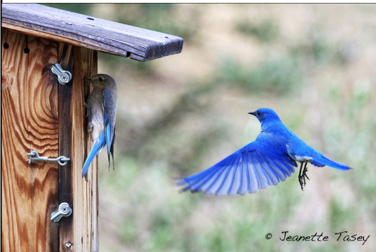
MOUNTAIN BLUEBIRDS at a nest box .