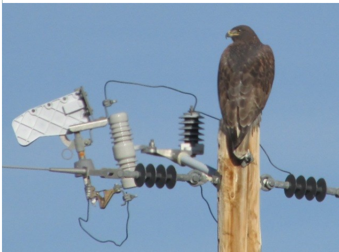
Ferruginous Hawk, seen on the Old Hardin Road east of Hardin by members on the November 7th Yellowtail Dam Afterbay Field Trip.

Non-Profit Organization PRST STD U.S. POSTAGE PAID BILLINGS, MT PERMIT NO. 27