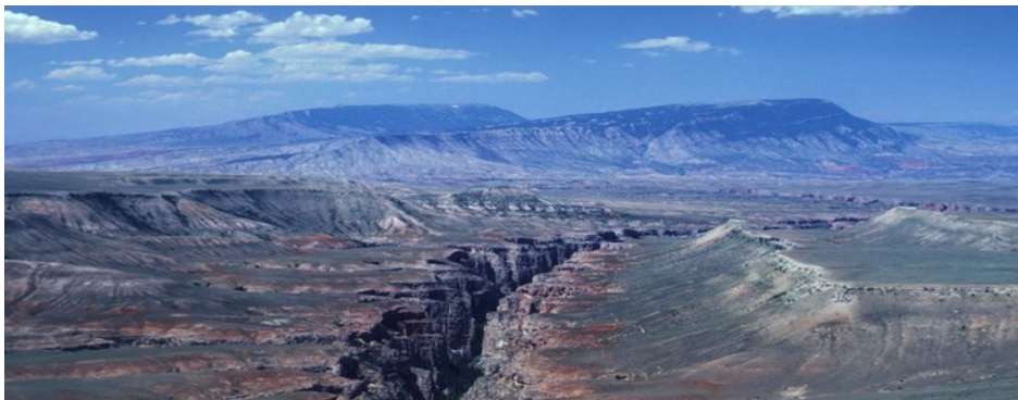
Big Pryor (left) and East Pryor Mountains from the Bighorn Mountains to the east. Devils Canyon in the foreground.

Many of us are familiar with the Pryor Mountains, located 40 miles south of Billings and just north of the Wyoming border, and know that they are unlike any other landscape in Montana and different from the Beartooth Mountains, only 40 miles to the west. With a documented diversity of unique ecosystems, the Pryor's provide recreational opportunities and economic assets to the area, attracting both tourists and job seekers. The Pryor's are also a rich resource for scientists, teachers, students, and lay naturalists, offering opportunities for biological and geological discoveries. The diverse habitats in the Pryor's are home to a broad range of birds, butterflies and other wildlife, including bighorn sheep, mule deer, black bear and mountain lion, and ten species of bats. Two hundred resident species of birds include Golden Eagles, Peregrine Falcons, Blue-gray Gnatcatchers and Calliope Hummingbirds. Equally important, the Pryor Mountains are a recognized sacred Native American spiritual site. Pictographs, tepee rings, ancient vision quest sites, and numerous shelter caves in the limestone canyons provide archaeological evidence of human use for at least 10,000 years.