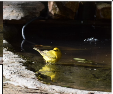
Yellow Warbler with fledgling photos by Will Crain in his own backyard, July 8, 2016. Great evidence of breeding there!