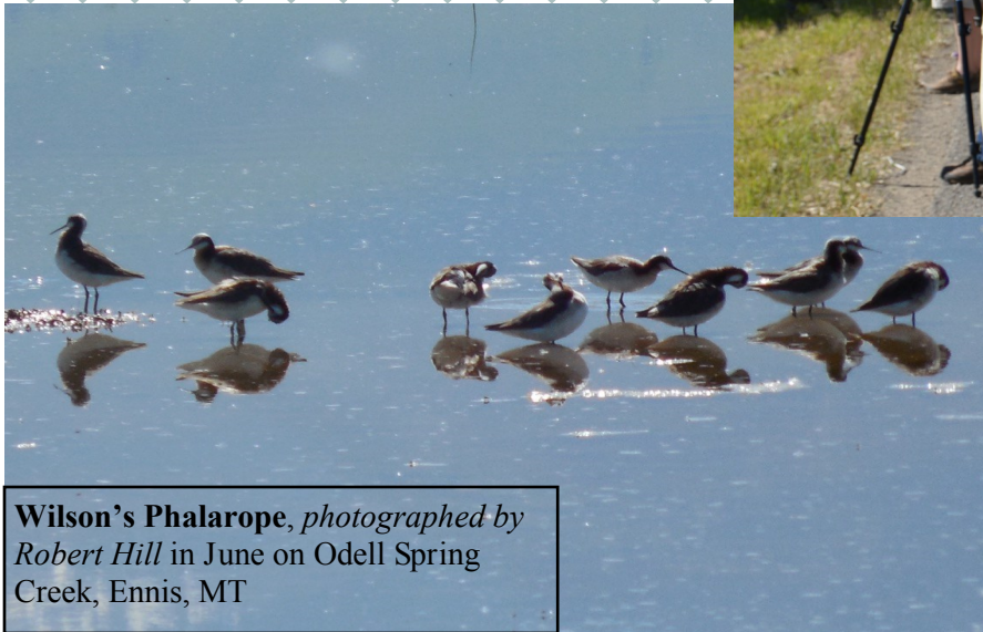
Wilson's Phalarope in June on Odell Spring Creek, Ennis, MT