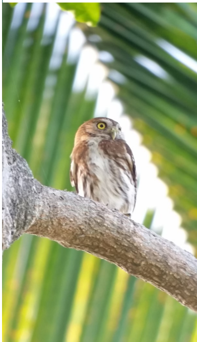
Burrowing Owl, from a trip to Costa Rica.

Non-Profit Organization PRST STD U.S. POSTAGE PAID BILLINGS, MT PERMIT NO. 27