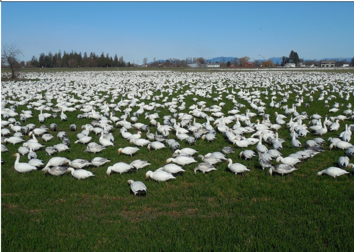
No official field trips occurred in February but Robert Hill submitted this photo of Snow Geese wintering in the Skagit Valley north of Everett, Washington on Feb. 17, 2018 from his car window. Nice trip, Bob!

A flock of Whimbrels (formerly known as Hudsonian Whimbrel) bustle about a beach in the Chilean coastal city of LaSerena. Whimbrels, as you know, breed on the Arctic tundra, nesting on the ground. When the chicks hatch, they are ready to leave the nest almost immediately. During the migration some Whimbrels may fly around 2500 miles non-stop to spend our winter feeding on small crabs on the beaches of the southern hemisphere. This photograph was taken in February, 2018. Perhaps we will be fortunate enough to see these same birds as they make the trek back up north in a few months!