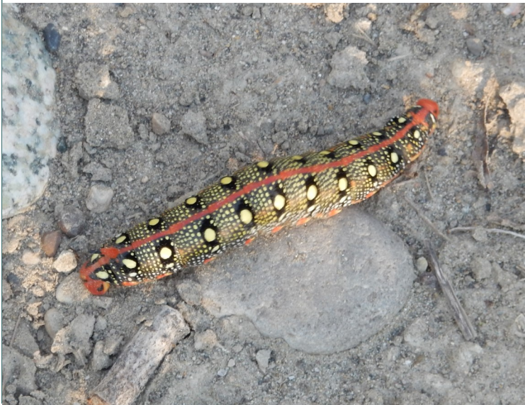
Spurge Hawk Moth caterpillar, photo by George Mowat seen at Riverfront Park during Sept. 5 field trip.

Non-Profit Organization PRST STD U.S. POSTAGE PAID BILLINGS, MT PERMIT NO. 27