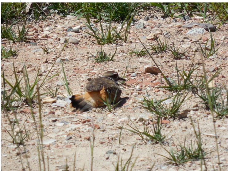
Killdeer in distraction display to protect her eggs or young. while on the Bluewater Creek trip in June.

Non-Profit Organization PRST STD U.S. POSTAGE PAID BILLINGS, MT PERMIT NO. 27