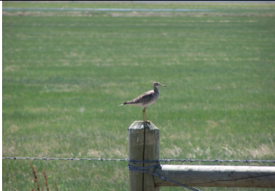
UPLAND SANDPIPER