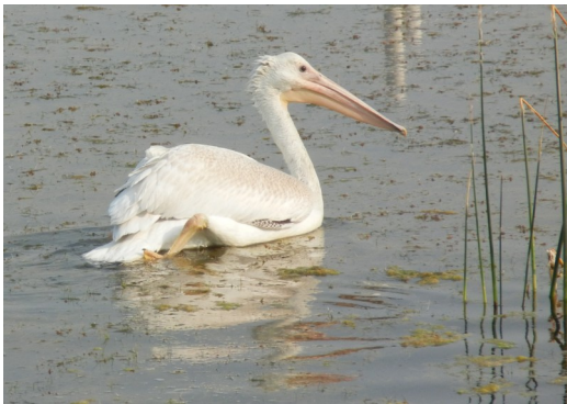
A YOUNG AMERICAN WHITE PELICAN AT BOWDOIN NWR