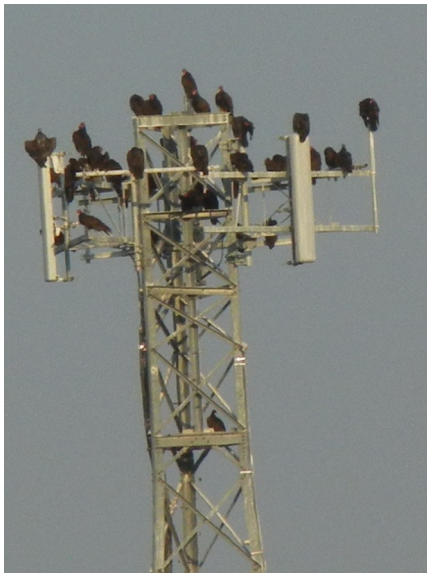
TURKEY VULTURES IN MALTA