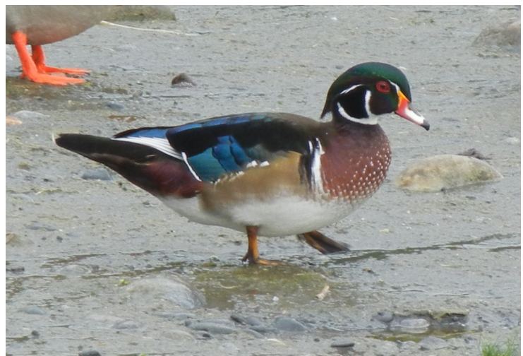
WOOD DUCK AT LAKE JOSEPHINE IN RIVERFRONT PARK.