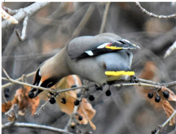
Bohemian Rhapsody! Excellent examples of this beautiful winter visitor.

Non-Profit Organization PRST STD U.S. POSTAGE PAID BILLINGS, MT PERMIT NO. 27