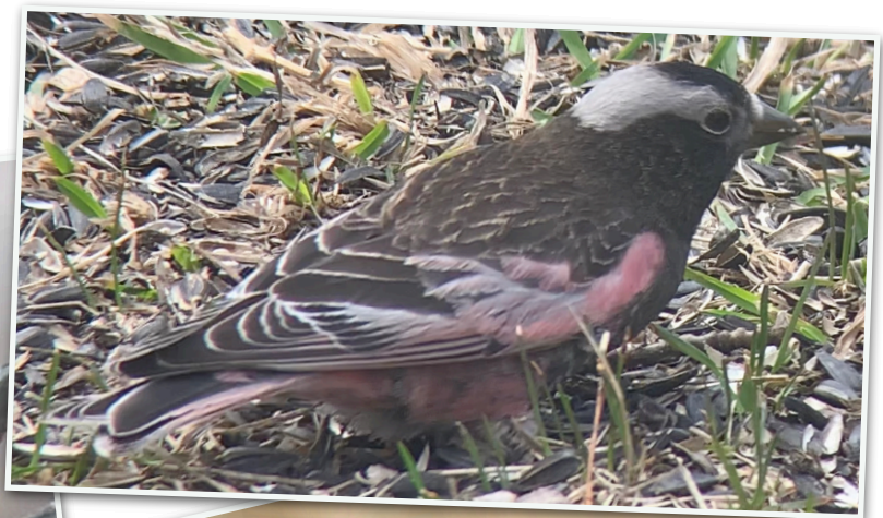
Top right: Black Rosy-Finch- March 2021 Below: Common Redpoll- March 2021 Bottom right: Steller's Jay- March 2021

Non-Profit Organization PRST STD U.S. POSTAGE PAID BILLINGS, MT PERMIT NO. 27