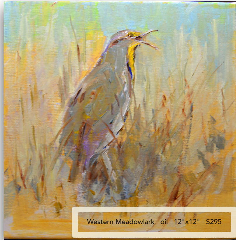
Western Meadowlark oil 12"x12" $295