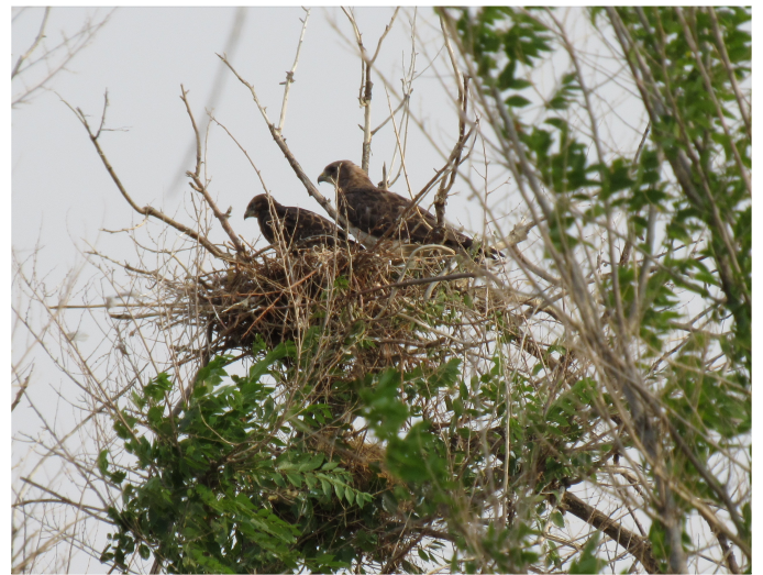
Above: Swainson's hawk nestlings sighted on the way to Big Lake Aug 2021 Left: Chestnut-collared Longspur