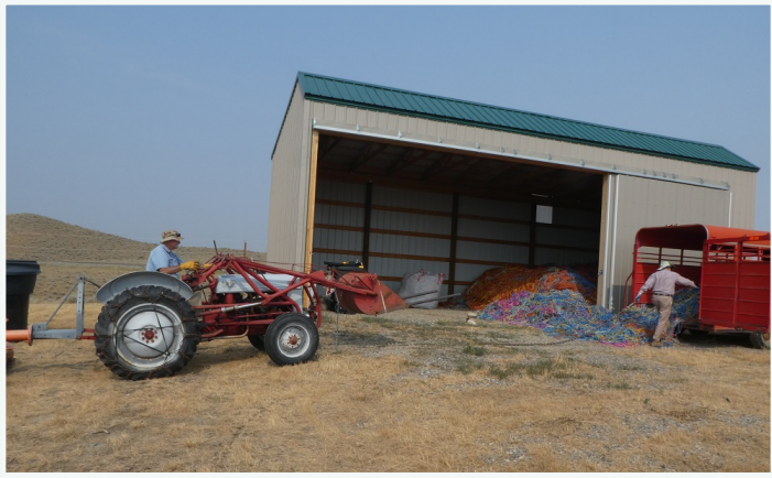
Unloading PAYS twine from the trailer

In early August, YVAS received a grant of $5,000 from Turner Enterprises, Inc. for the TCRS. This grant will enable us to reach more twine users through advertisements in local newspapers in the surrounding counties and to have necessary maintenance funds available if maintenance is needed at the TCRS. Thank you to the Flying D Ranch's foreman who is committed to twine recycling, continues to bring annual deliveries of twine and who recommended the TCRS to the Turner Enterprises grant committee.