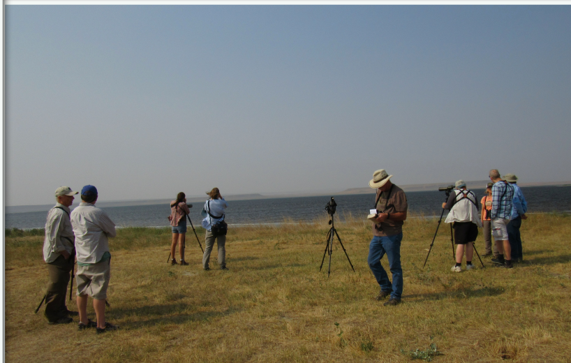
Field Trip to Big Lake Aug 2021.

Please submit articles, notes, and photos that you would like to see in a YVAS Flyer newsletter on or before the 20th of the month preceding the month of preferred publication. This is your chance to use your writing and reporting skills! All contributions are appreciated.