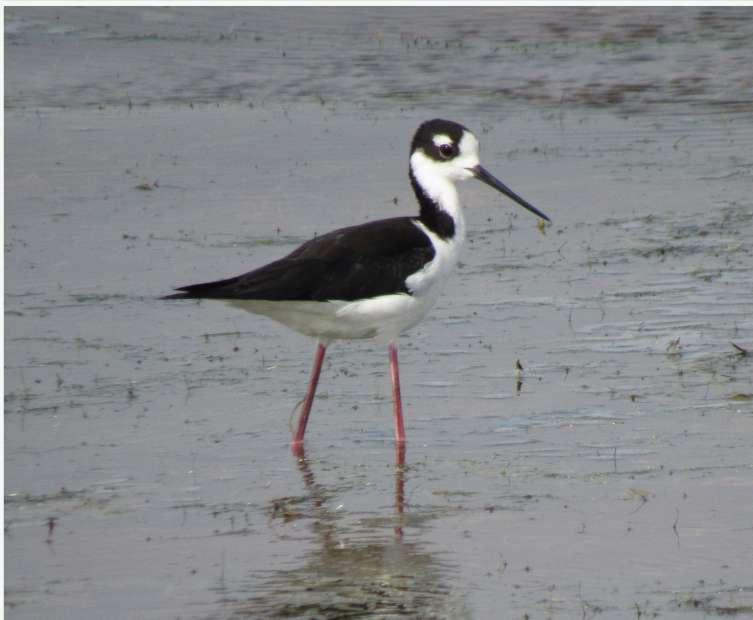
Black-necked Stilt.

Non-Profit Organization PRST STD U.S. POSTAGE PAID BILLINGS, MT PERMIT NO. 27