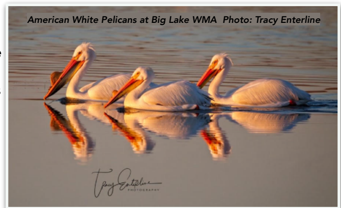
American White Pelicans at Big Lake WMA

Jim Hanson also noted that in a nest search on the large island on the southwest side of Big Lake, the following were found for the first time: 269 ring-billed gull nests, 72 American white pelican nests and 5 double-crested cormorant nests. It's possible that the small island on the north side was "full," and the birds "overflowed" onto the other island. There were also 104 duck nests on this island. The lake could use some more rain or snow.