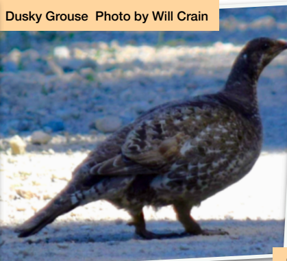
Dusky Grouse