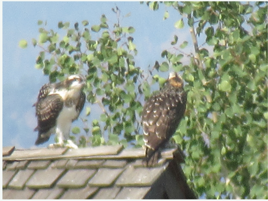
Above: Photo from Mary an Osprey monitor in the Paradise Valley. The last couple of years, Ospreys that she monitors actually perch on roof tops. It's an uncommon sight!

Non-Profit Organization PRST STD U.S. POSTAGE PAID BILLINGS, MT PERMIT NO. 27