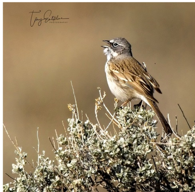
Sagebrush Sparrow