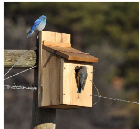
Mountain Bluebird pair