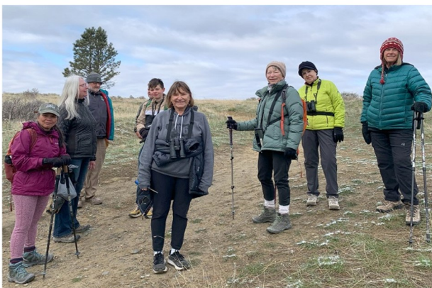
YVAS Bluebirders at Phipps Park April 22

If you would like to learn more about Mountain Bluebirds, please join us on Monday, May 15 at the Mayflower Church on the corner of Poly and Rehberg Lane. A social with coffee and cookies begins at 6:30 PM; the program begins at 7:00 PM.