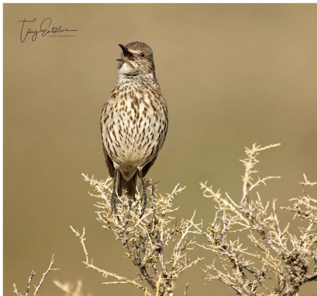
Sage Thrasher