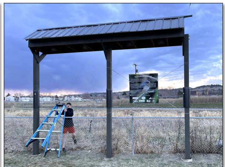
Installation of sign - Photo by Bruce Waage