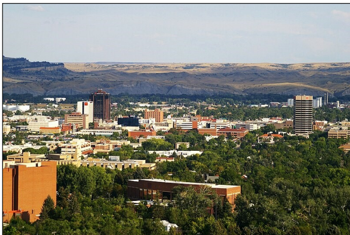
Billings downtown

Trees are not just ornaments or objects of mystery and beauty. And they are not just sources of leaves to rake or clean off your roof in the fall. And they are not even something that is always in the way if you are a city worker and you are trying to put in a pipe, road sign, wire or make sure sidewalks are free of tripping hazards.