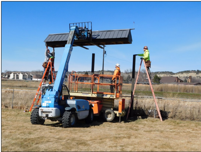
Raising the roof - Photo by Pam Pipal

KTVQ's excellent coverage of the event can be seen HERE .