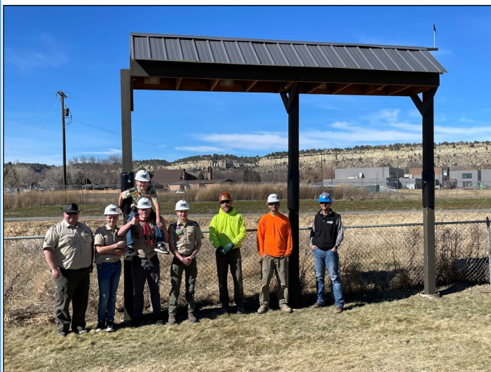
Finished swallow structure - Photo by Bruce Waage