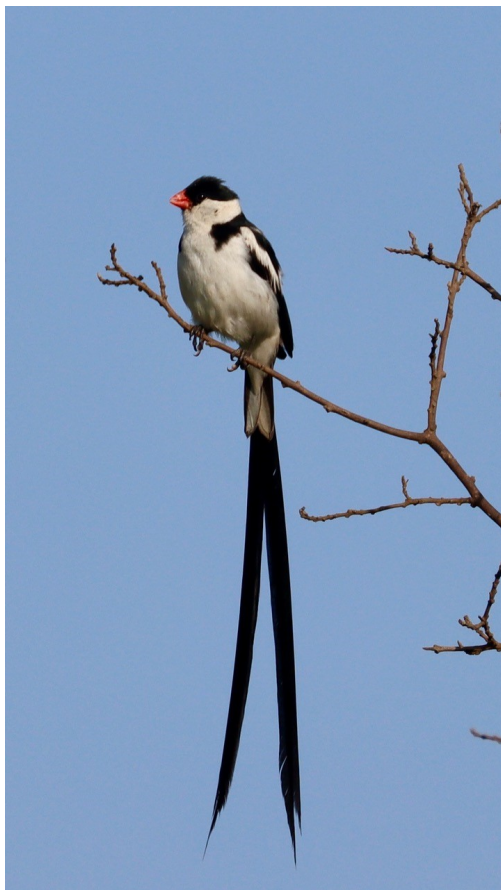
Pin-tailed Whydah