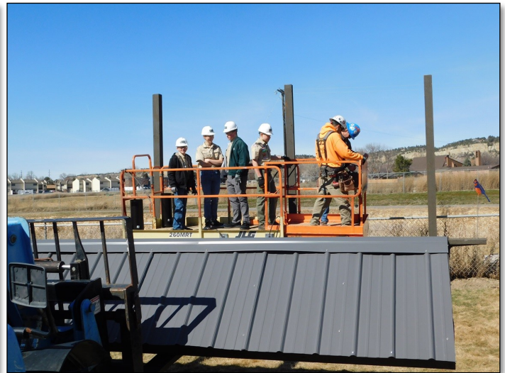
Roof installation