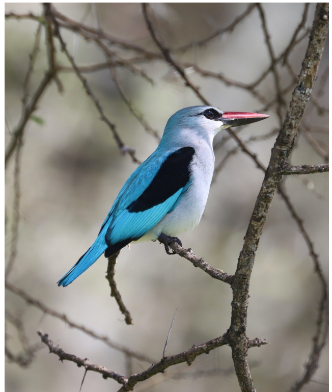
Woodland Kingfisher