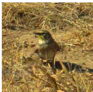
Horned lark

Lodge Creeks in a great birding corridor. Our first spotting of serious interest