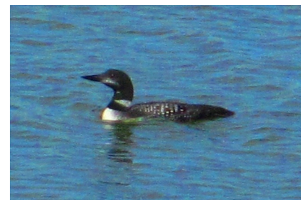
Common loon

turned out to be a surf scoters, rare in the interior so a jewel for us birders. Thankfully we had 3 digital scopes to view these migrants that we chased around the lake to get better views ...only to get better views of other birds sitting in the middle of the lake... 3 Greater White-fronted Geese! Loons were sporadic on this gorgeous Fall day but still a welcome site.