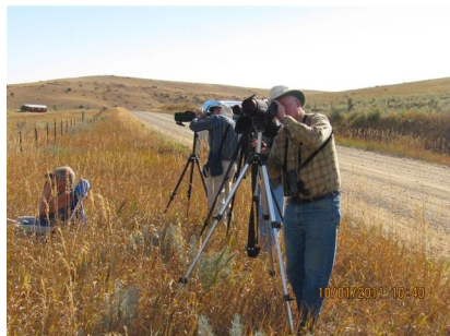
YVAS Crew at work

We met as usual at Rocky, and 5 daring birders in two vehicles headed to the land and waters west of Boyd 22 mi from Billings and another 8 mi to Cooney Dam. Although Cooney is Montana's most used recreation area, for us it was nearly deserted.