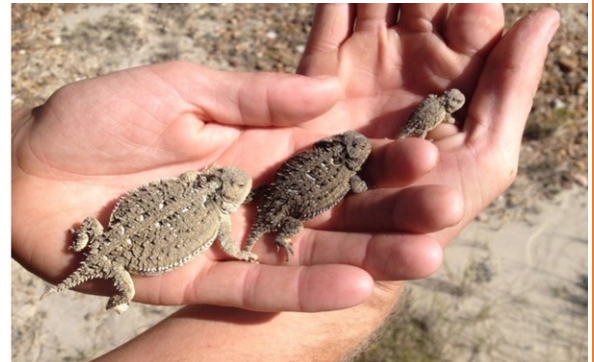
Greater Short-horned lizards: adult, juvenile and young of the year.