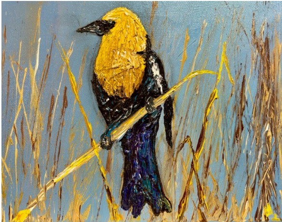
Yellow-headed Blackbird by Mike Weber Palette knife acrylic on canvas.