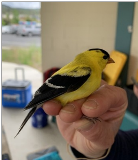
American Goldfinch