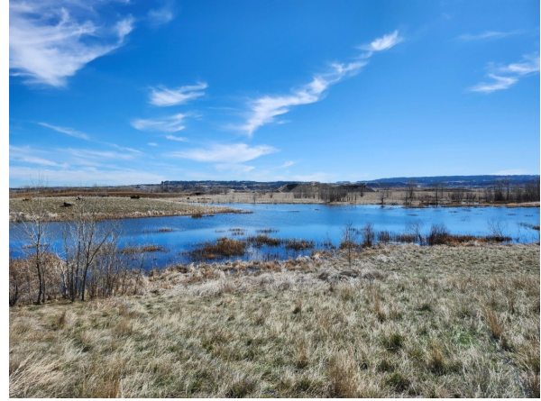
Dover Ponds Views

The location and method of construction and installation will also take some research.