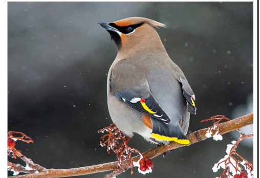
Bohemian Waxwing

Join YVAS on May 19th to meet these celebrated artists and enjoy a presentation of their photographs.