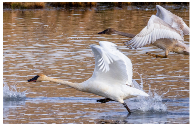
Trumpeter Swans take off

YVAS programs are free and open to the public. They are held on the 3rd Monday of the month at the Mayflower Church on Poly and Rehberg Lane. A social with coffee and cookies begins at 6:30 PM; the program begins at 7 PM.