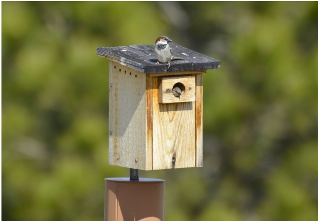
An unwanted pair of House Sparrows starting a nest in a bluebird box.