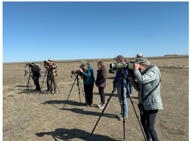
Big Lake birders

An intrepid choice of back roads rewarded us with lots of Bald Eagles and two Golden's hanging out over a prairie dog town, two Ferruginous Hawks,