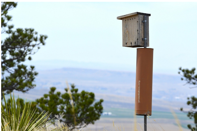
Room with a view