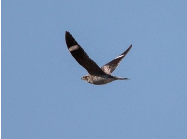
Common Nighthawk

The arrival of warm summer nights in Montana also brings two expertly camouflaged and bat-like fliers to Montana's grasslands: Common Poorwills and Common Nighthawks. We are looking for volunteers to survey these cryptic, data-deficient species across the state.