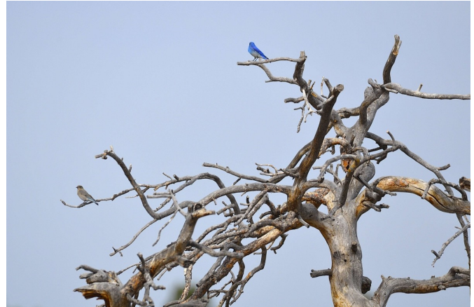
Pair of Mountain Bluebirds