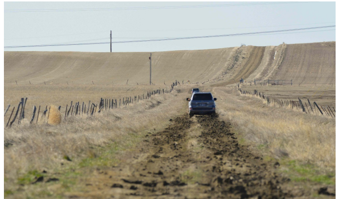
Molt gumbo

Is there a better way to celebrate 406 Day than a YVAS field trip to Big Lake?