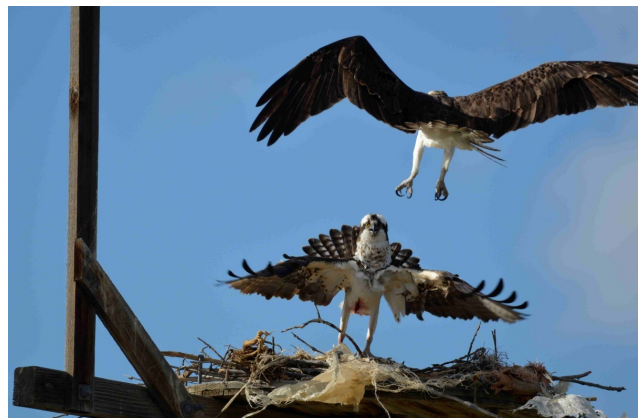
Female ospreys fight over the nest or the mate?

The osprey monitors were also riveted by the interactions Ginny Waples reported of a chick fight among 3 female ospreys over the dude 55/E in a Billings area nest.