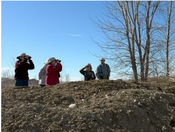
Surveying birds and topography

It will be a minimum of two years before the Natural Area is opened to the public. In the meantime, this will allow us time to review the various types of bird blinds, which are surprisingly numerous! Styles vary depending on the planned purpose or usage for the bird blind, the location, the climate, species of birds and the available budget.