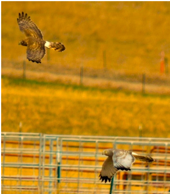
Northern Harriers in tandem

Some optimistic birders did make it as far as Rocky Mountain College that morning. After a discussion in the parking lot about the road conditions (poor) and the visibility (poor and getting poorer) and then checking the weather report for next Sunday (good!), this hardy crew voted to reschedule the trip to Big Lake for April 6th.