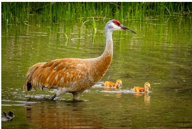
Sandhill Crane with colts