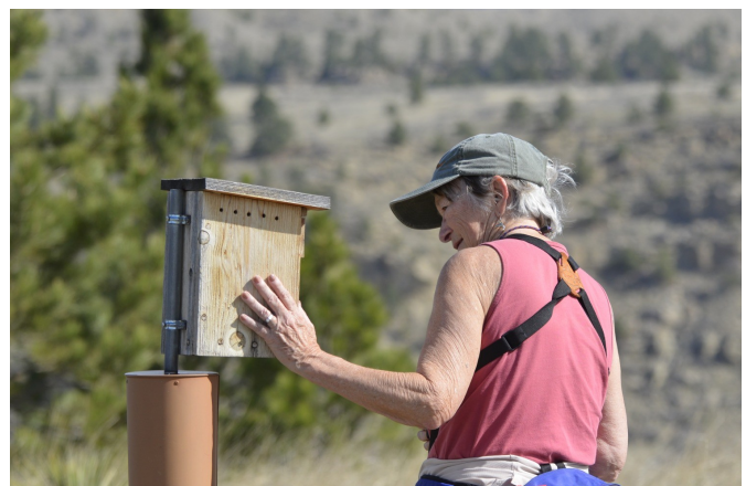
Checking bluebird nesting boxes