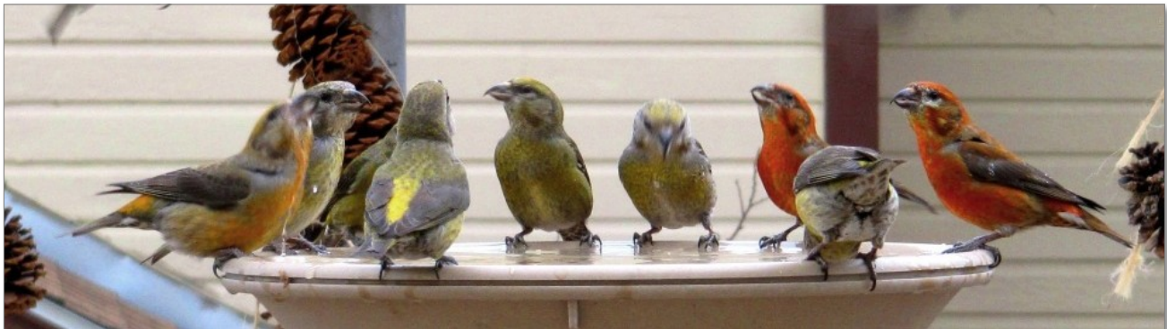
Photo by Will Crain of Red Crossbills polishing off 5 seed barrels per week in his backyard.